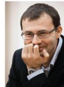
Roman Kopin Governor Chukotka Autono- mous Region