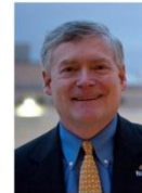
Mead Treadwell Lieutenant Governor State of Alaska