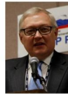
Sergei Ryabkov Deputy Minister of Foreign Affairs, Ministry of Foreign Affairs of the Russian Federation