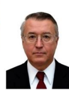
Vladimir Vinokurov Ambassador and Executive Secretary of the Bilateral Presi- dential Commission, Ministry of Foreign Affairs of Russia